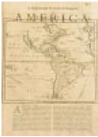
7. (World ) A New Map of the English Empire in America , Senex, c1719, 27 x 32, outline hand color

A handsomely framed map of a better portion of North America. This map was originally published by Morden and was later printed by Senex with some minor alterations. Notable for the enormous mountain range shown stretching from Michigan to Florida. The map has been backed by a conservator and is suffering from some loss around its edges and some ink staining in the lower left corner. Archivaly framed. $2100.00