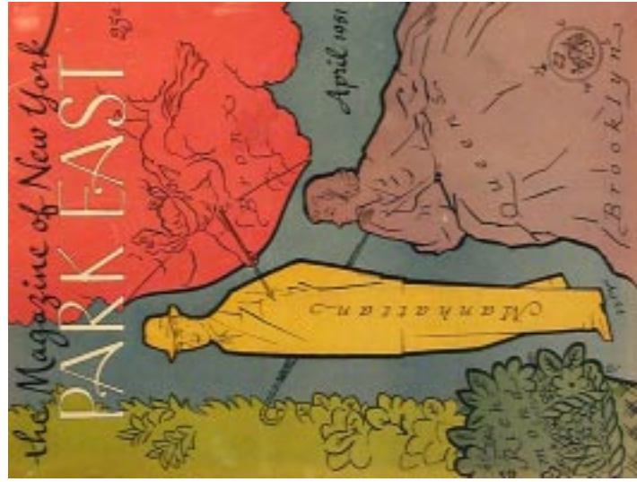
(New York City) Pique - Park East, 1951, 11.5 x 8.75, Full color

A caricature map from a simpler time. In this anthropomorphic approach the isle of Manhattan is a neatly dressed gent, Brooklyn Queens is an admiring lady, Staten Island is a basket of flowers and the Bronx is Cupid on a cloud with arrow drawn. A colorful image in good condition with some minor scuffing. Exceedingly rare. $125.00